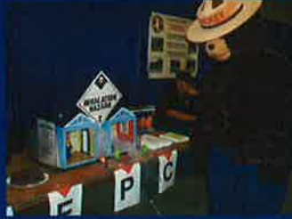
LEPC public education at the 2008 Columbia County Safety Expo